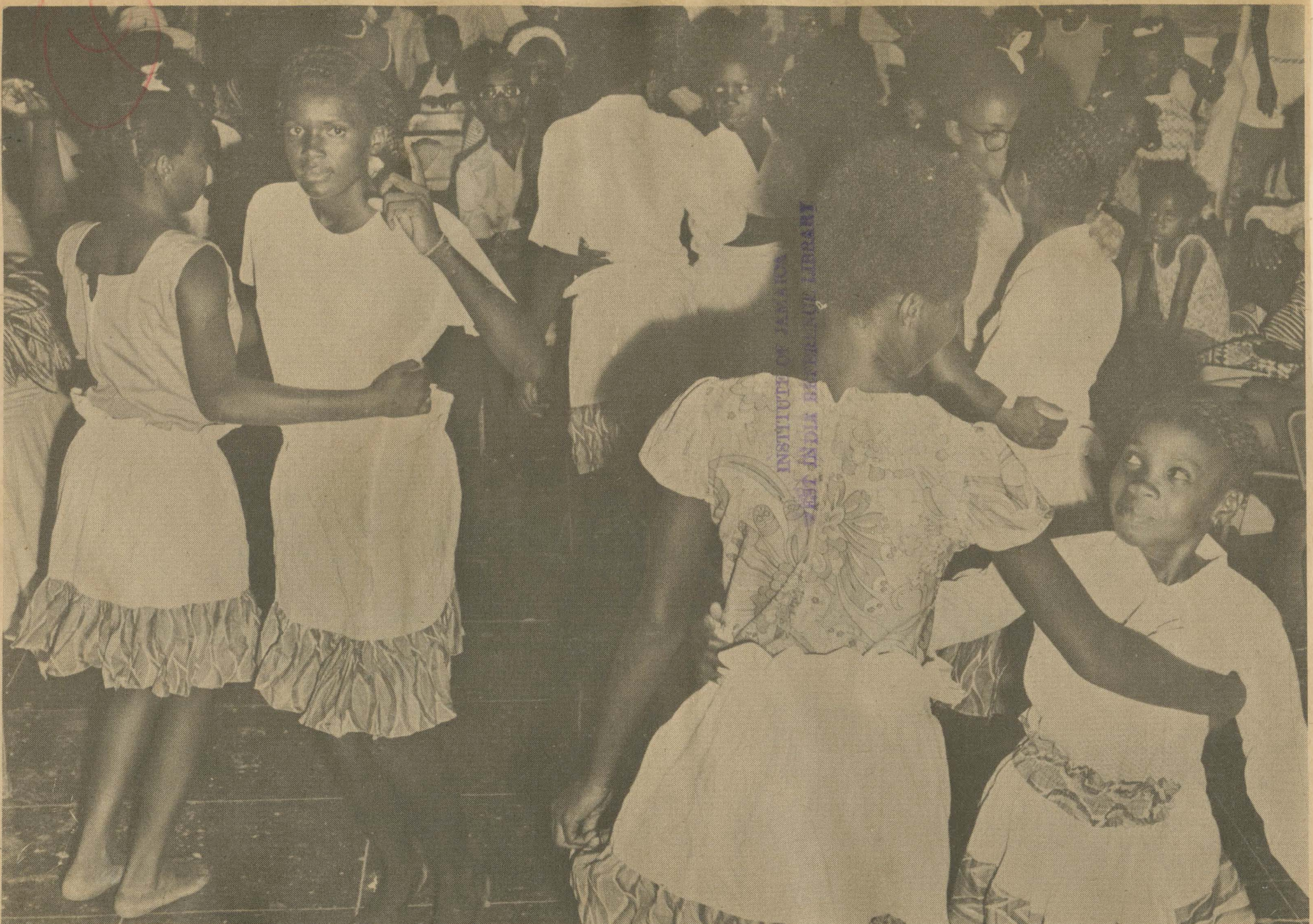
A dance by students of the Bethesda Primary School.