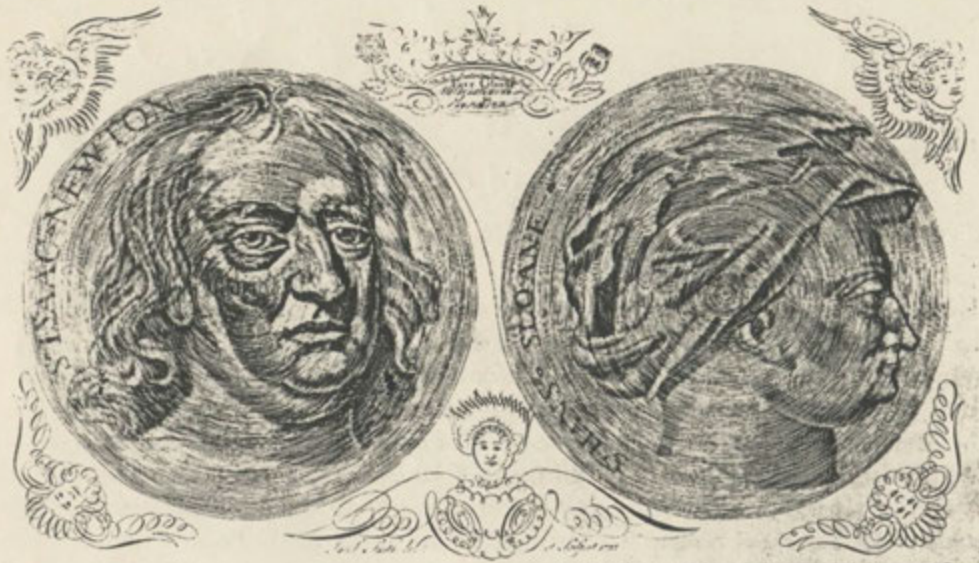
Fig. 1. Sir Isaac Newton and Sir Hans Sloane, engraving by Jacob Smith.

scientific work was shared by John Ray, William Derham, John Locke, and many other members of the Royal Society. Claims of scientific merit in Sloane are supported by the manner in which he fulfilled his editorial responsibilities in the Philosophical Transactions from 1693 to 1712; his network of correspondents helped to collect and publicize science. While the Transactions have been criticized as a miscellany of curious rather than learned articles, we should recognize that Hans Sloane held a more open-minded view of scientific work than many of his critics. He was receptive to communications from all researchers and willing to consider any observed phenomena and plausible explanations, even if they presented challenges to established preconceptions and theories. This approach had its philosophical basis in the medical empiricism of Thomas Sydenham and John Locke, and was particularly fruitful in medicine and the life sciences in general. By contrast, a narrower approach concentrating on mathematics and the physical sciences would have severely limited both theoretical and experimental advances. What is important in the history of science is not merely what fits the context of later science, or fires revolutions in thought; as Hans Sloane knew, progress in science may require the pursuit of intriguing but ultimately unsatisfactory paths.