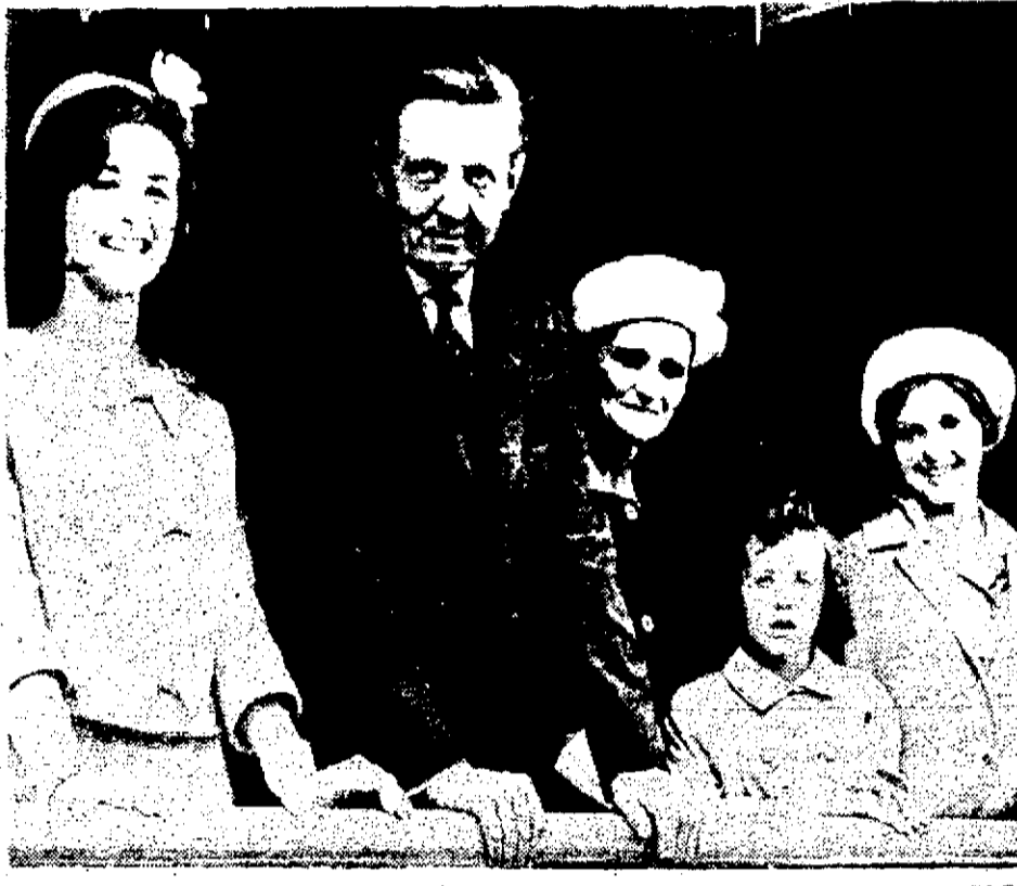
Viscount De L'Isle and Dudley V. C. Governor General-Designate of Australia, embarked with his wife and family aboard the P. & O. liner "Orcaades" at Tilbury, Essex, on Thursday, for Australia. Photo shows Viscount De L'Isle with his wife and family before their departure.